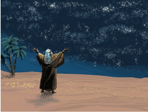
Abraham believed God (Gal 3:6±, Ge 15:5,6±)

Genesis 20:1 Now Abraham journeyed from there toward the land of the Negev, and settled between Kadesh and Shur; then he sojourned in Gerar.