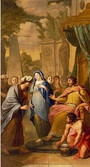
"Here's my sister Abimelech!"

Proverbs 12:22 Lying lips (LIKE ABRAHAM) are an abomination to the LORD, But those who deal faithfully are His delight.